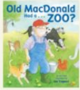
Available to read on Hoopla