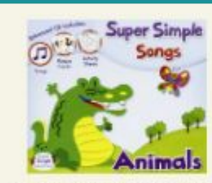
Let's Go to the Zoo By Super Simple Songs